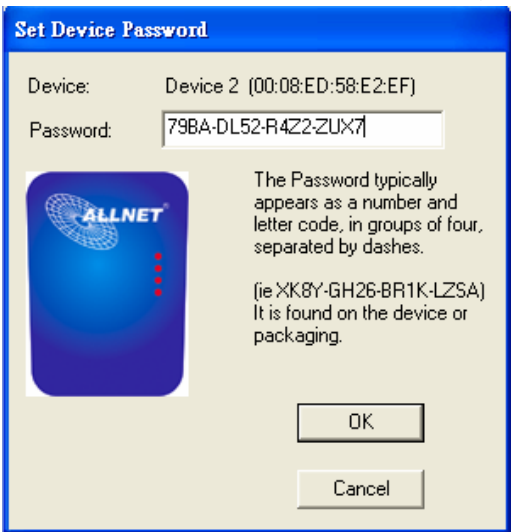
Figure 5: Set Device Password

"OK" button. The confirmation box will notice the password you entered correct or not. If not, please check the device password and re-try again.